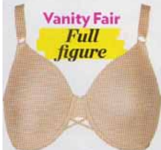
Vanity Fair Full figure

Staff take "It's smoothing and fits really well."