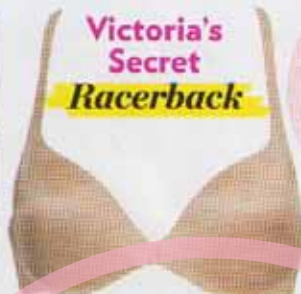
Victoria's Secret Racerback

• Buy it! "Incredible Racerback Demi Bra" in nylon-spandex, $48; victoriassecret.com