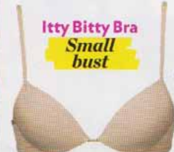
Itty Bitty Bra Small bust

Staff take "It disappears under a fitted tank, and the fabric is incredibly soft."