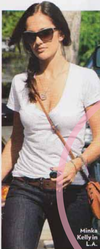
Minka Kelly in L.A.

Staff take "The soft cups keep my chest in place without being bulky."